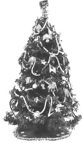
Stars and Stripes

“Yes, Virginia, there is...” Designer Christmas Tree – features many styles of Santa and Father Christmas, reindeer, stockings and bells in a red, green and gold color scheme. Father Christmas stands on the top as red and green bead and gold tinsel garlands swag around the tree and an elegant red ribbon swirls among the branches. The red tree skirt is dotted in bits of gold.