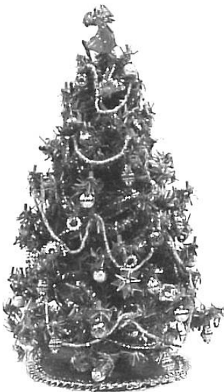
Olde World Christmas

These Designer Christmas Trees feature all the ornaments and decorations needed to decorate an 8” tree (not included in K & D). No more searching all over for just the right trims to go together and buying huge packages of beads, etc. when only a few are needed. Everything is right here! A generous supply of decorations allows for extras to trim matching garlands, wreaths, etc. if the back of the tree is not decorated or a smaller tree is used. The kits and decorations packages include directions to make a tree using craft pine. Each Designer Christmas Tree is available in the following 3 packages: the kit package (K) includes all the parts to make ornaments, garlands, tree skirt, trims and tree topper with complete instructions on decoration assembly for tree trimming as well as suggestions for decorating the tree. The decorations package (D) includes pre-assembled decorations and suggestions for tree trimming. The tree package (T) includes a complete, 8” craft pine tree with all trimmings and decorations in place, ready to display.