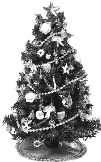
A Sterling Christmas

“A Sterling Christmas” Designer Christmas Tree – features 21 different silver and iridescent ornaments (usually 6 of each) topped with a large 2-sided silver star. Silver tinsel & iridescent pearl garlands swag the tree. The tree skirt is silver lame.